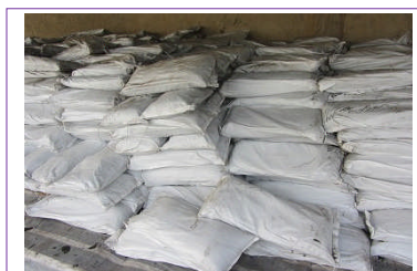
B) Fusible bags in Polybags in loose