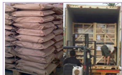
C) paper bags palletized or in loose